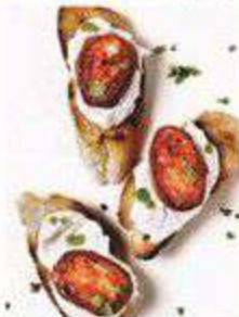
FRIED BRUSCHETTA TOPPINGS